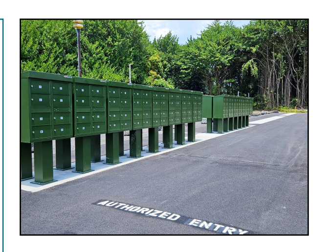
4th and Kaloli

Once all 4 sites have mail service available, notification to all current boxes on the main roads will be given as to when service will be discontinued and the box removal will begin. For full reports please see the President's Corner and the Mail Parks Reports on our website.